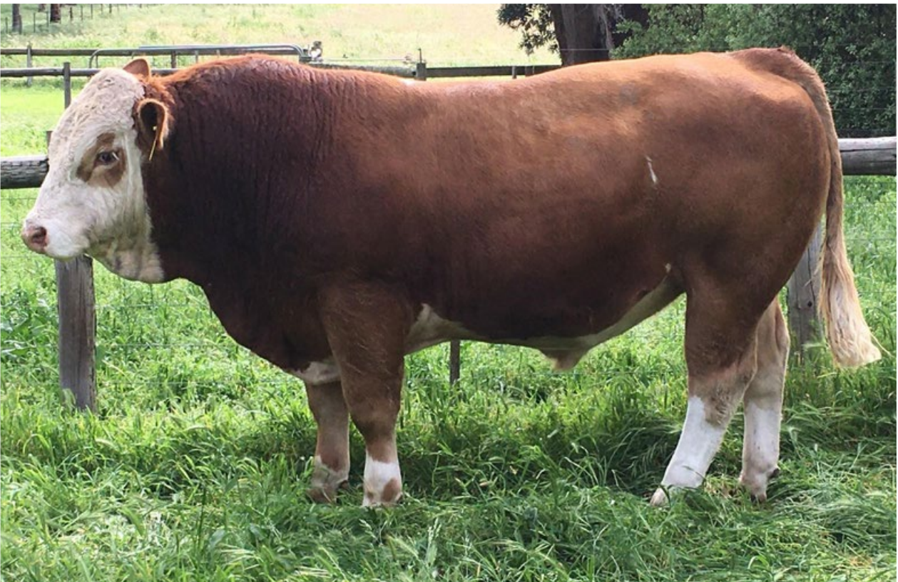
LOT 4 TUGULAWA PANDER