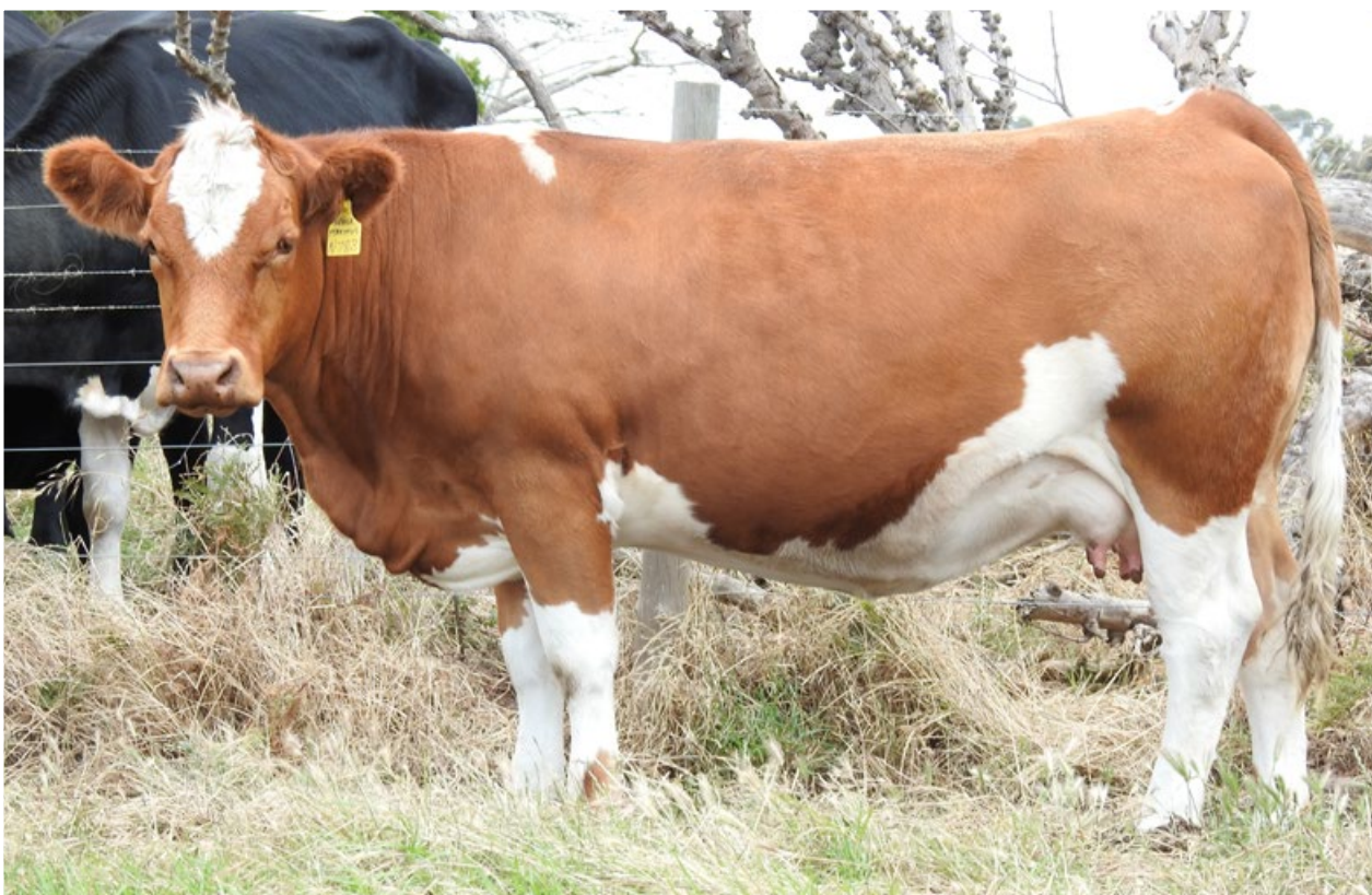
LOT 28 TUGULAWA NELL