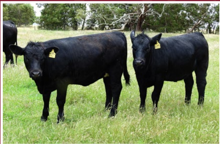
LOT 42, LOT 41