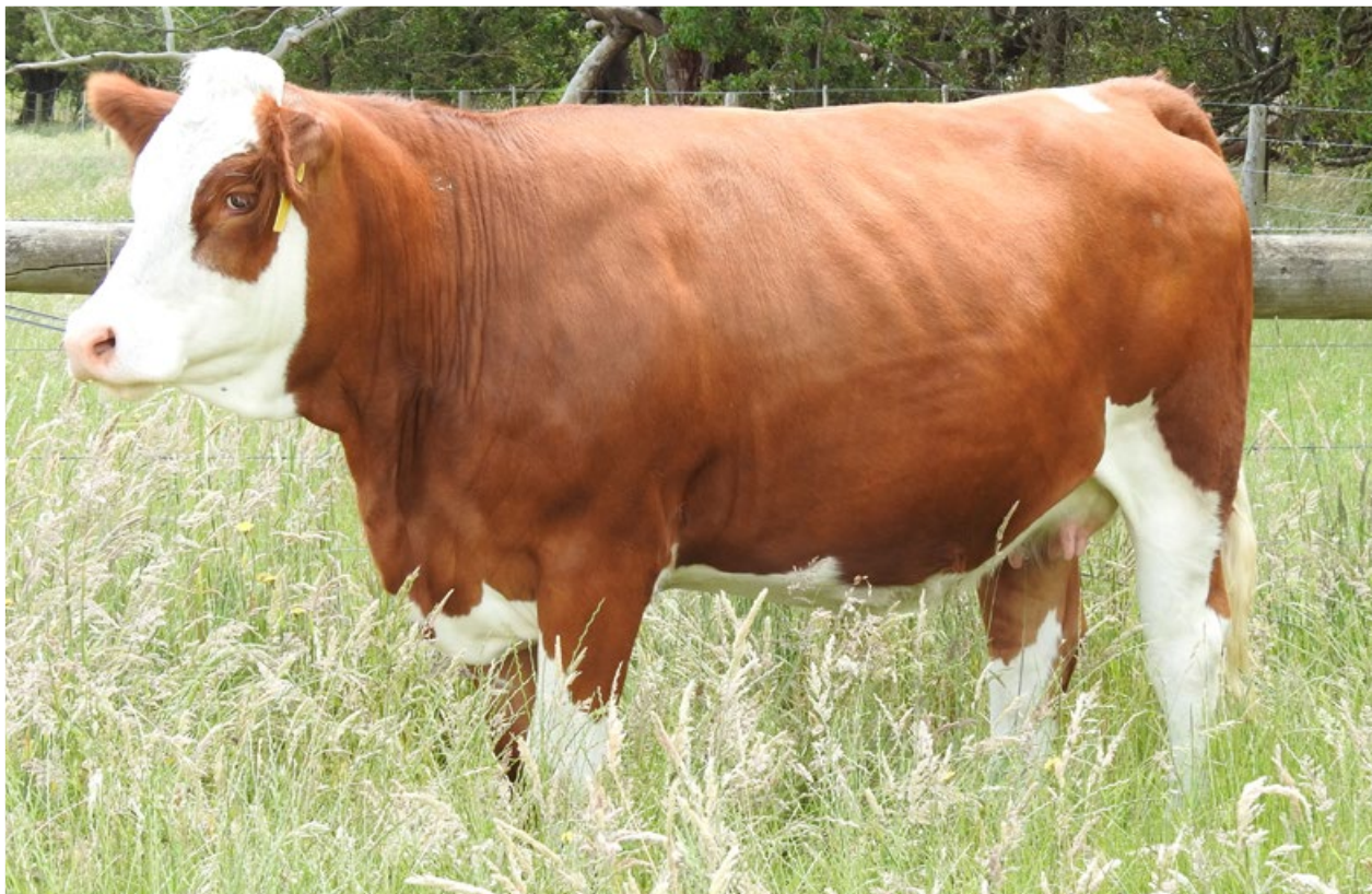
LOT 27 TUGULAWA POH