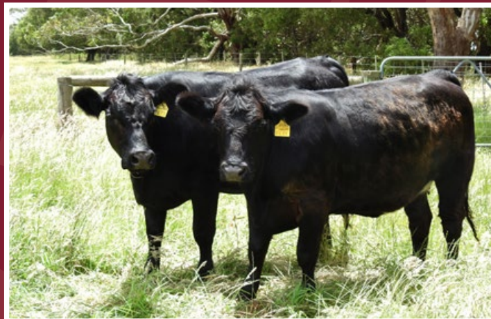
LOT 34, LOT 35