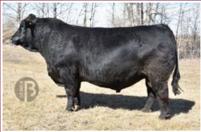
WLB BOUNTY HUNTER 365C (P) (B)