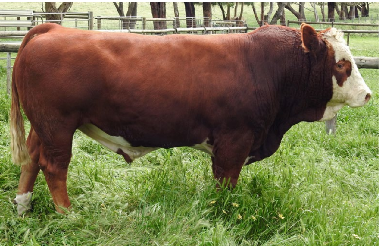
LOT 8 TUGULAWA QUALITY