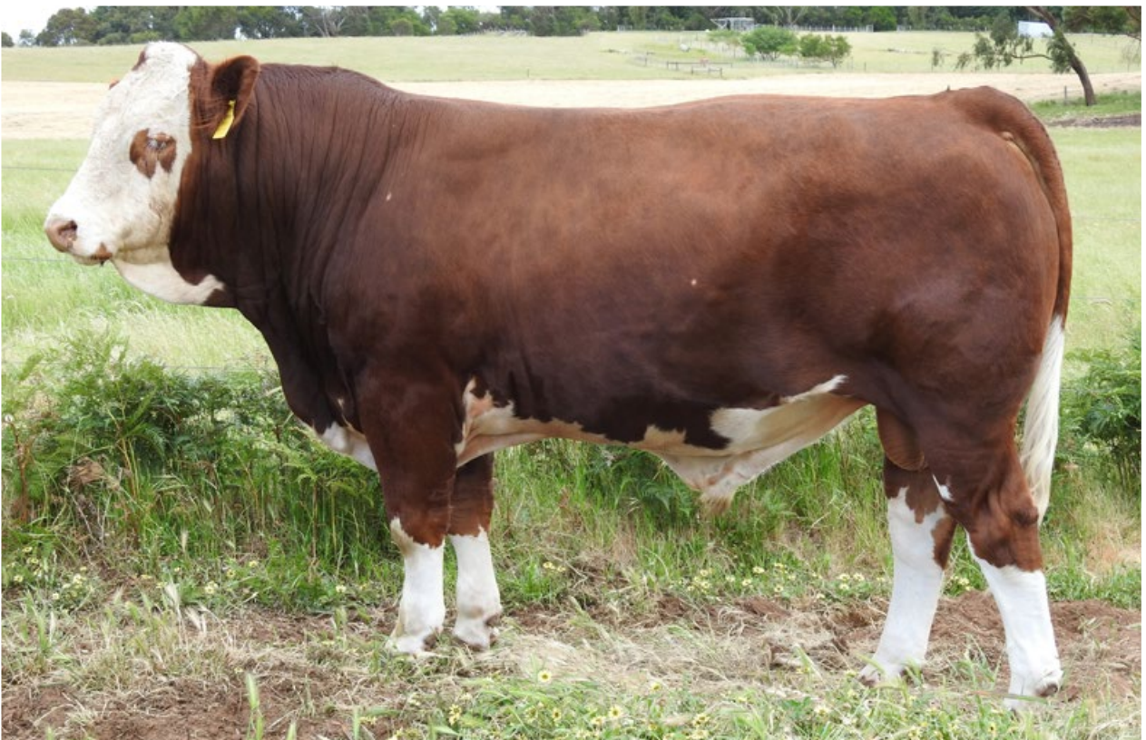
LOT 9 TUGULAWA POWER HOUSE