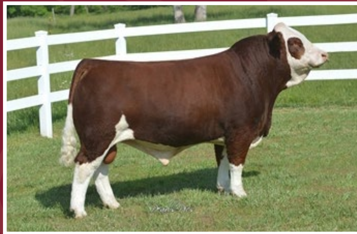
FSS MAXIMUS (P)