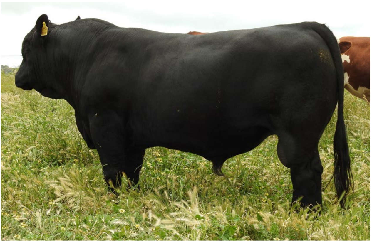
LOT 13 TUGULAWA PILOT