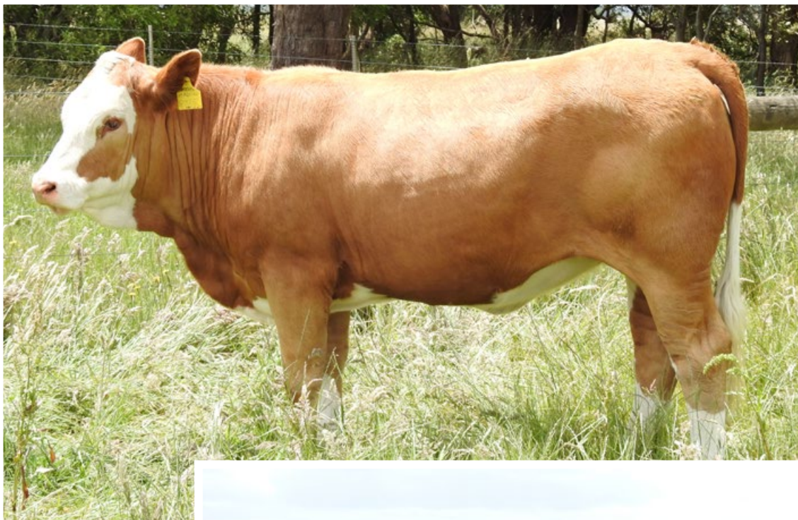
LOT 32 TUGULAWA QUEEZIE