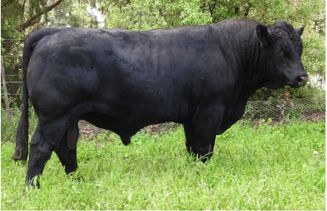
LOT 1 TUGULAWA PIRATE