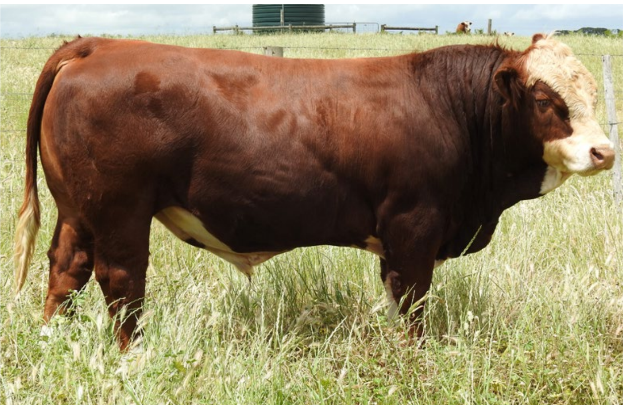
LOT 19 TUGULAWA QUIZZY