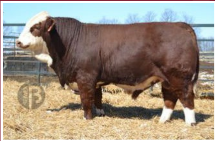
BAR 5 HEXTOR 1223 (P)