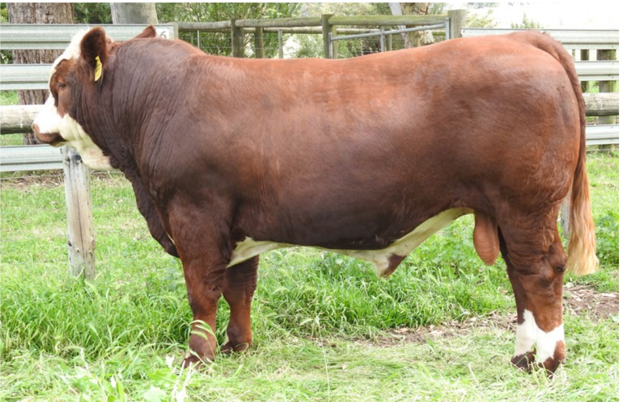
LOT 2 TUGULAWA QUANTUM