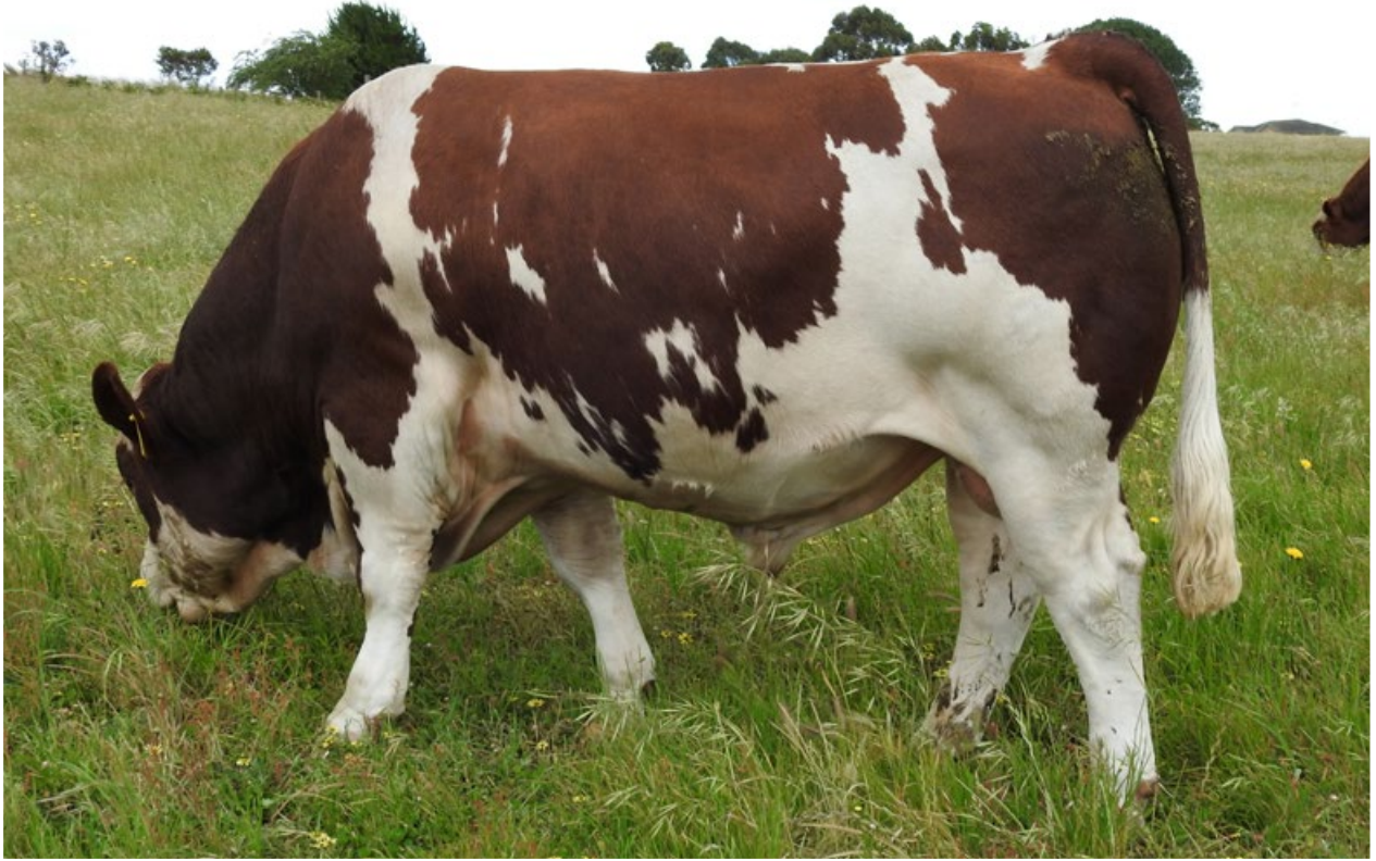
LOT 3 TUGULAWA PAY TIME