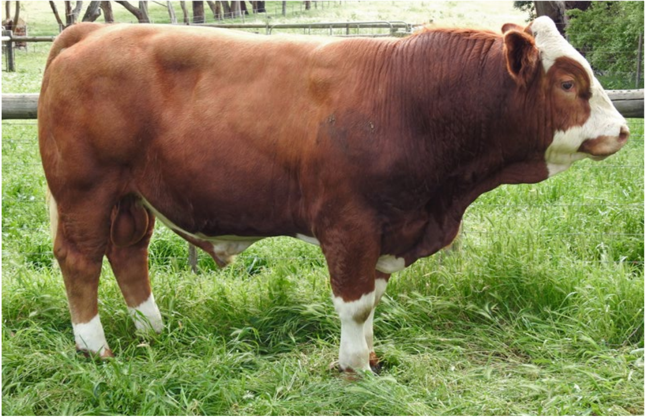
LOT 6 TUGULAWA QUENTIN