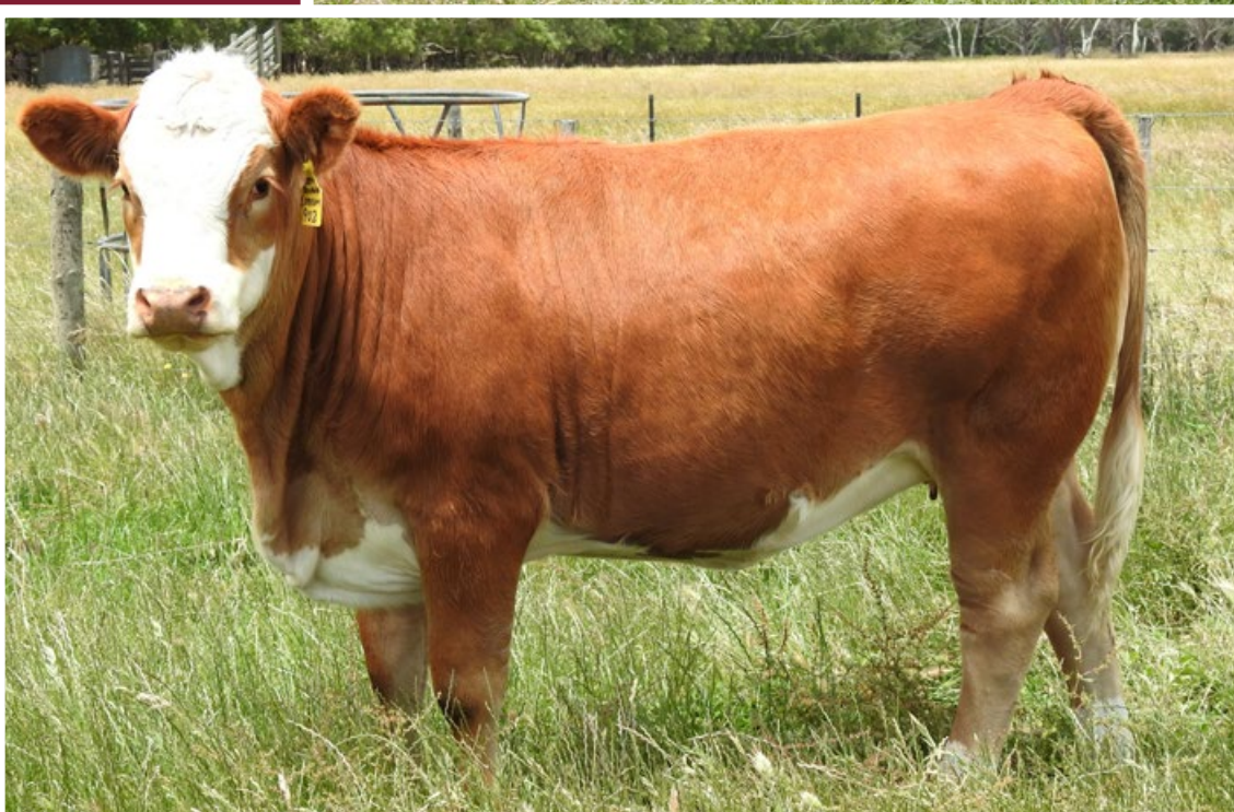
LOT 40 TUGULAWA ROSA