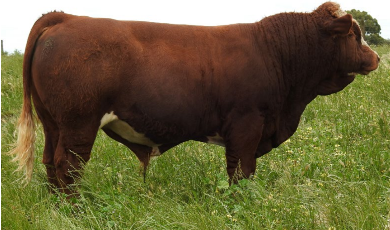
LOT 16 TUGULAWA QUONGO